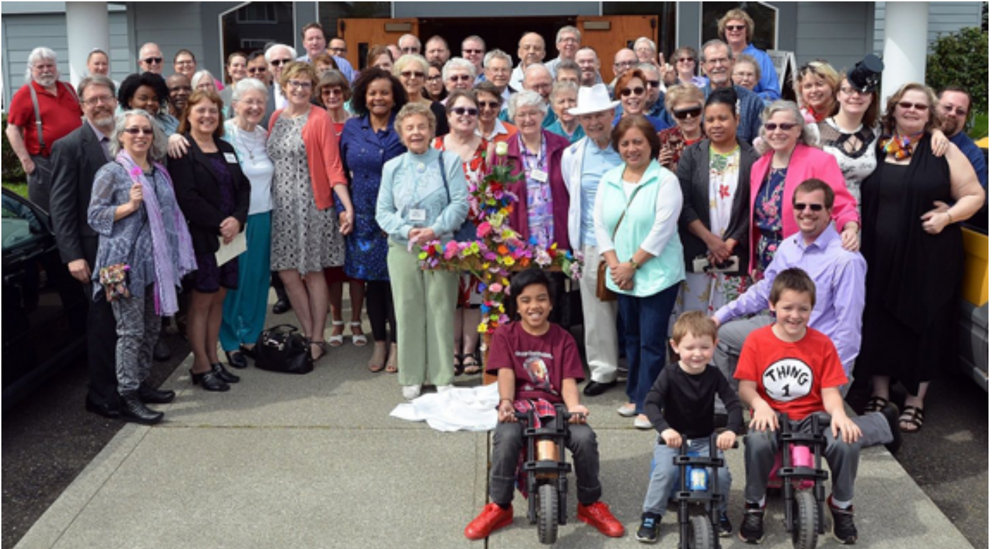
United Christian Church Congregation on Easter Sunday, April 16, 2017

Find Direction at United Christian Church, An Open and Affirming Congregation. No matter where you are on life's journey, you are welcome here.